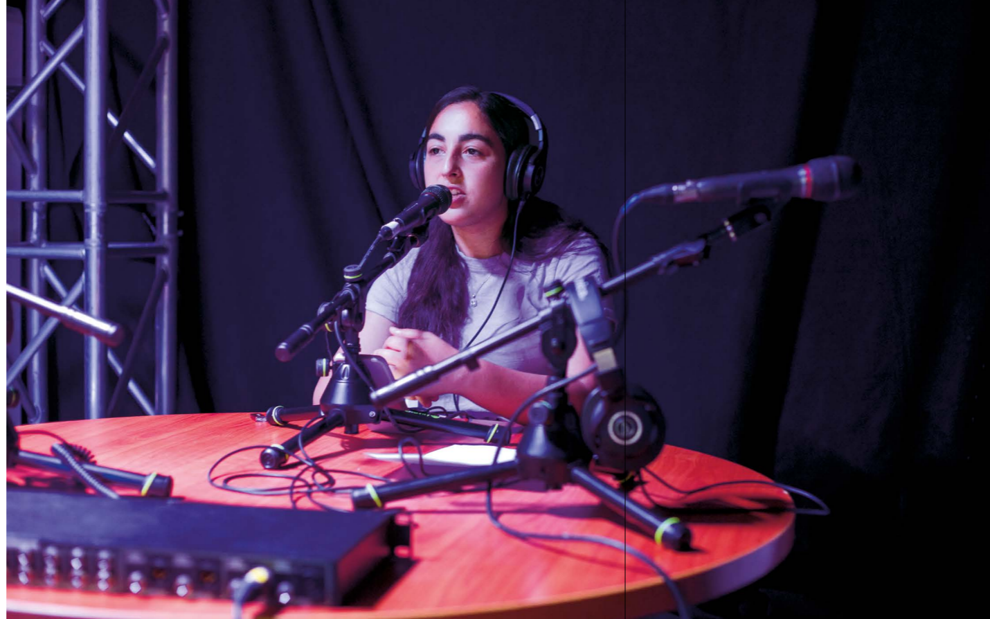
During the sound training course at Kan Ya Makan Rada, a centre for professional training and social integration in Fez, Morocco. Partner: Moroccan Association for Aid to Children in Precarious Situations

DROSOS FOUNDATION is a member of Ethos, and is committed to promoting sustainability and positive social change both through the management of its financial capital and through the projects and programmes financed with it.