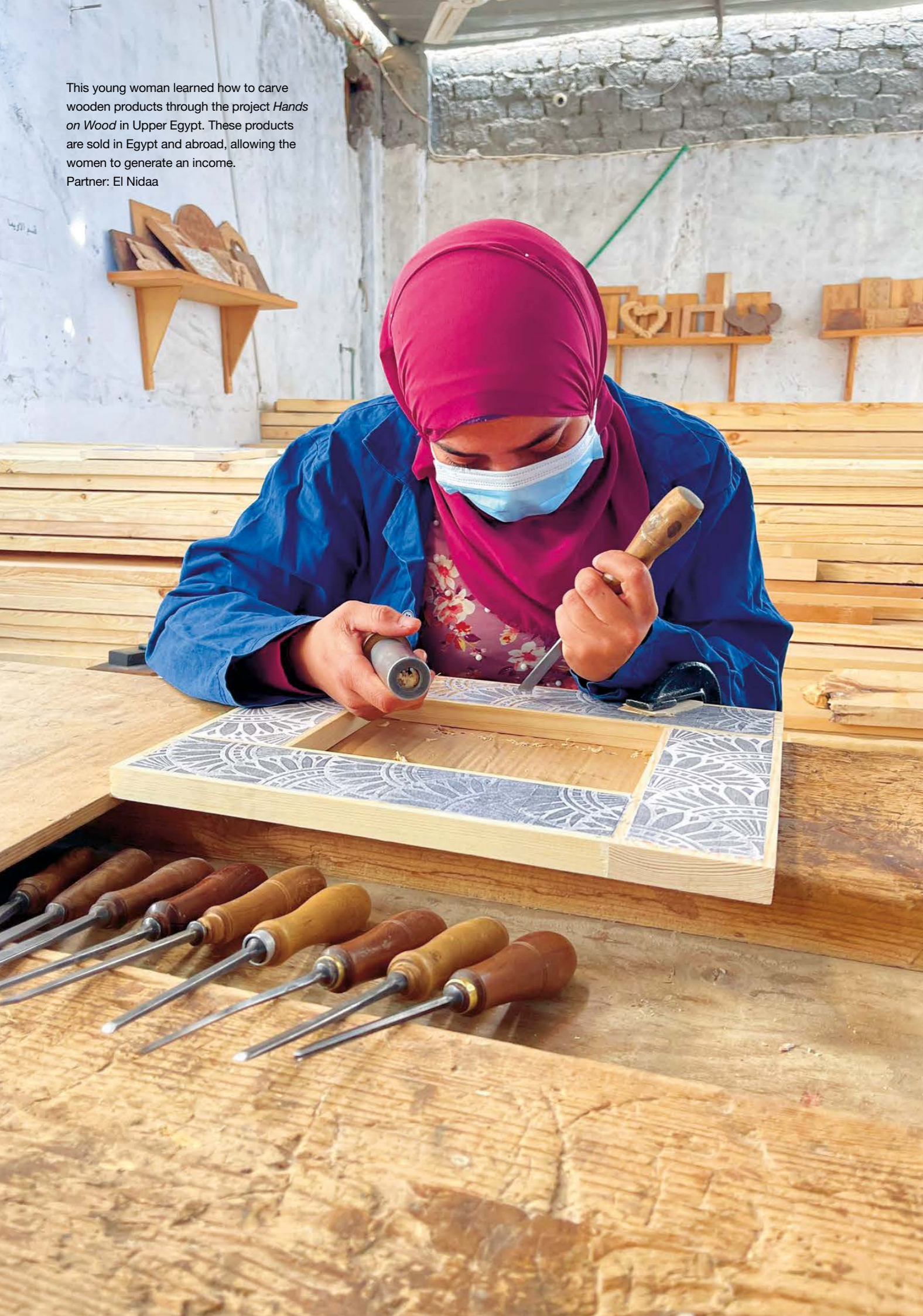
This young woman learned how to carve wooden products through the project Hands on Wood in Upper Egypt. These products are sold in Egypt and abroad, allowing the women to generate an income. Partner: El Nidaa