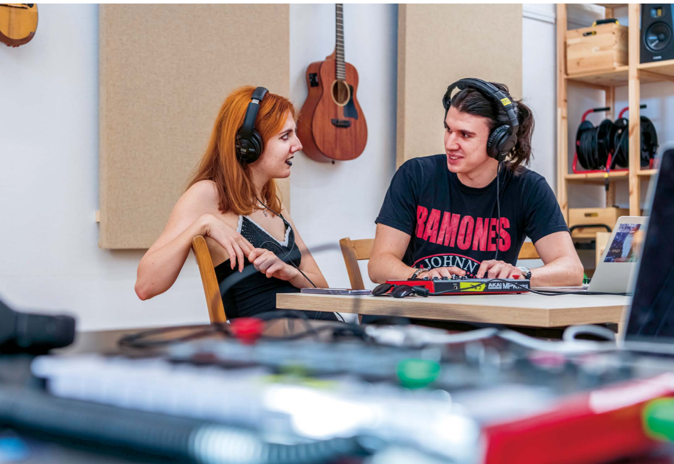
Young people learn how to produce their own song during a workshop in Basel, Switzerland. Partner: Association HitProducer