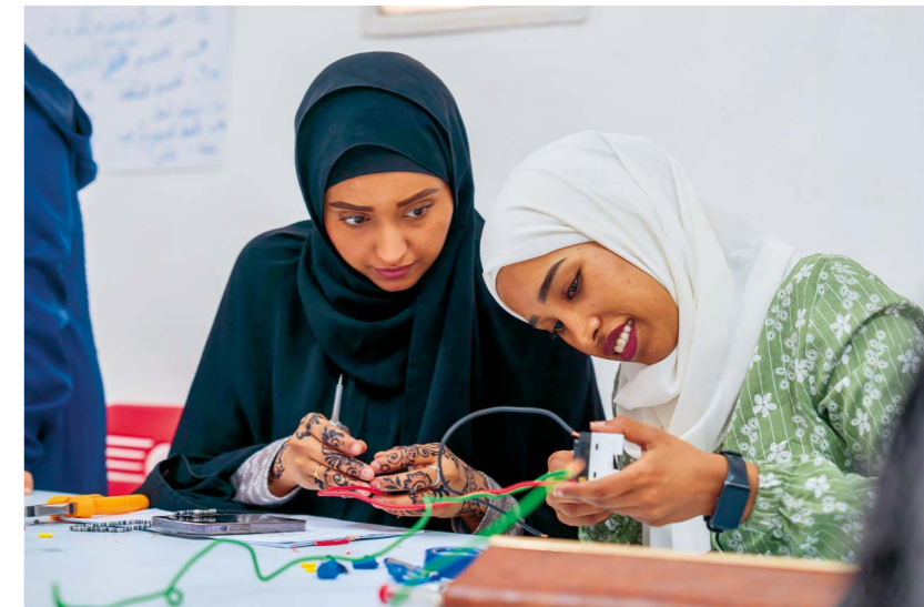
These young women take part in the electrical class and the intensive technical home maintenance training run by project SHINE in Jordan. Partner: Collateral Repair Project