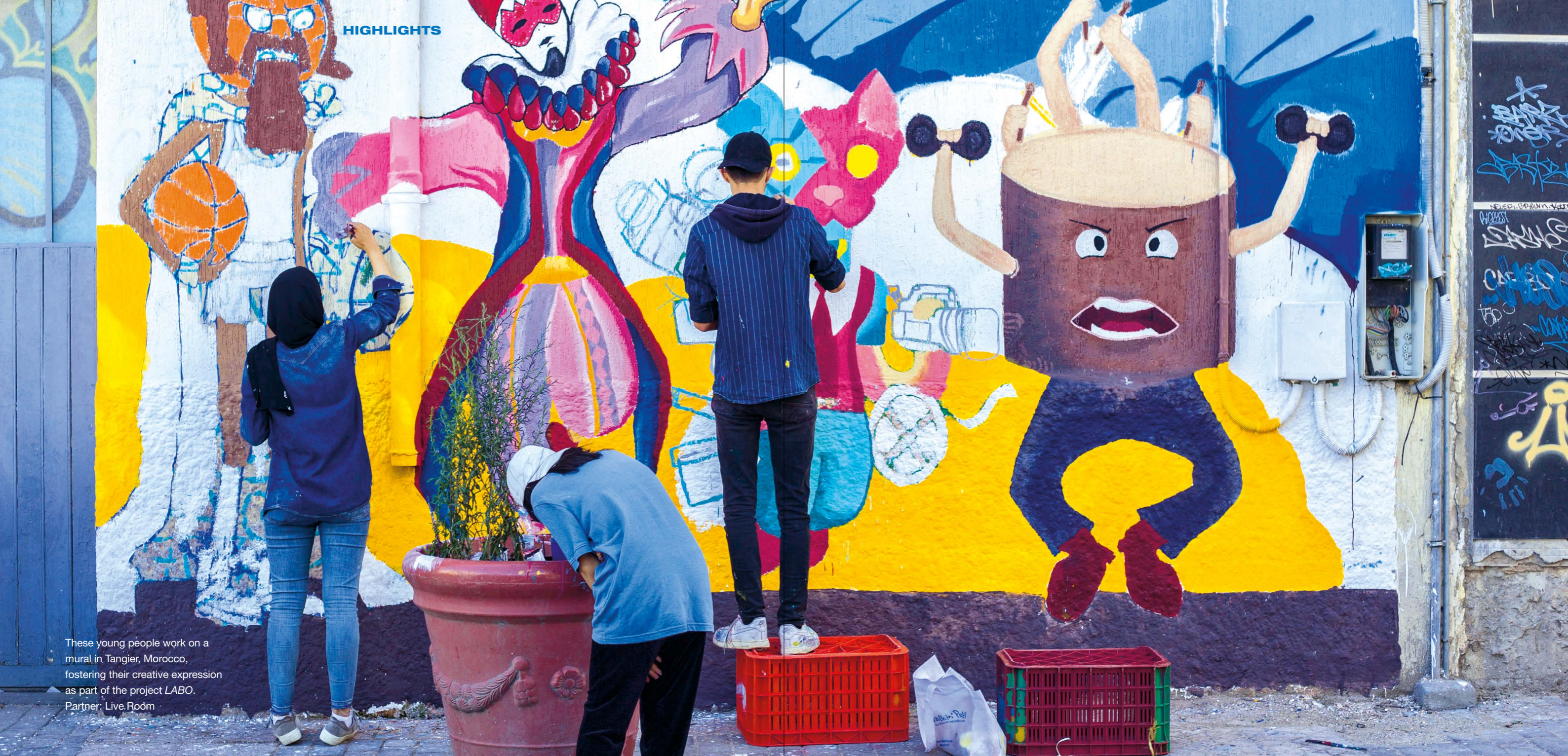
These young people work on a mural in Tangier, Morocco, fostering their creative expression as part of the project LABO. Partner: Live.Room