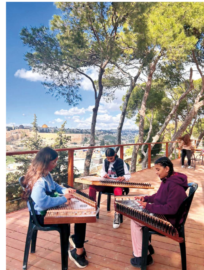
Learning music in a peaceful environment: Girls during a winter camp in Jerusalem. Partner: Jerusalem Youth Cultural Forum

DROSOS FOUNDATION's programme to foster access, inclusion, and participation in cultural education brought together various actors from the field of cultural education in Germany and Switzerland in a joint network. The programme's activities paved the way for continuous extensive knowledge exchange in this field. The partner organisations partici-