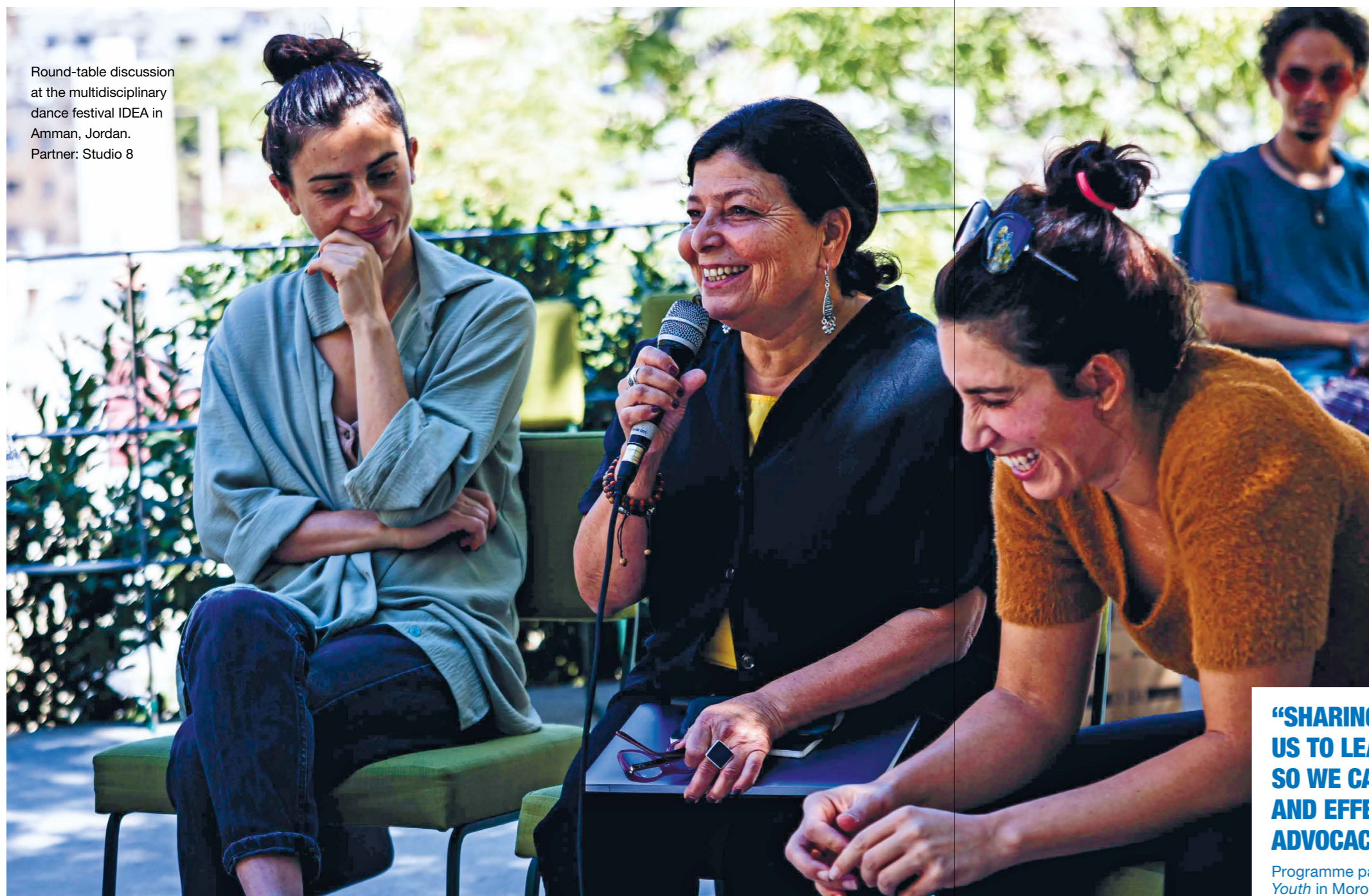
Round-table discussion at the multidisciplinary dance festival IDEA in Amman, Jordan. Partner: Studio 8

In the framework of its programme Employability for Vulnerable Youth in Morocco and Tunisia , DROSOS FOUNDATION initiated and funded common trainings for partner organisations from both countries to exchange insights on the challenges and opportunities in developing income-generating activities as associations. The result was the emergence of a collaborative network, providing mutual support and knowledge sharing to enhance the work of these associations in their communities in both countries. Further, the network identified and documented best practices, serving as a tool for learning and inspiration more broadly. Another positive outcome was the successful collective advocacy effort to include the associations in the new law on social economy in Morocco . CARE Morocco collected input from other partner organisations within the DROSOS programme and shaped the amendment and adoption of the Social and Solidarity Economy (SSE) framework bill as the civil society representative to the Ministry of Tourism, Handicrafts, and Social Economy. Thanks to these efforts, the law now also includes associations and vulnerable people in the SSE model, which previously had been based solely on the legal framework and approach of cooperatives.