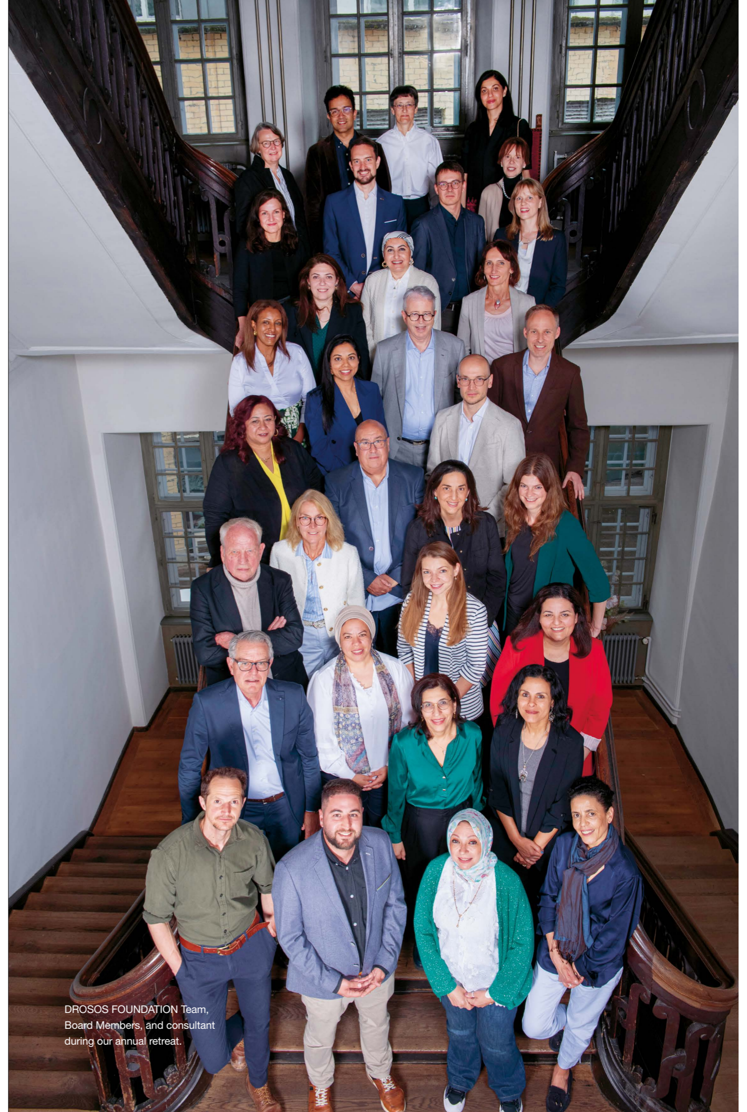
DROSOS FOUNDATION Team, Board Members, and consultant during our annual retreat.

info@drosos.org www.drosos.org www.linkedin.com/company/ drosos-foundation