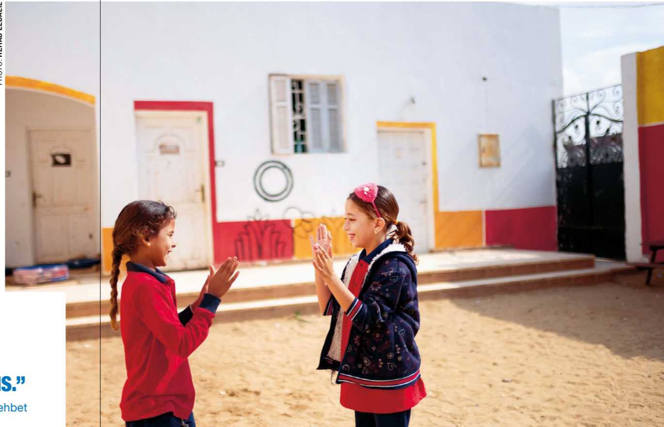
Girls in Al Ayat, Giza governorate, Egypt, enjoying some play time. Partner: Man Ahyaha